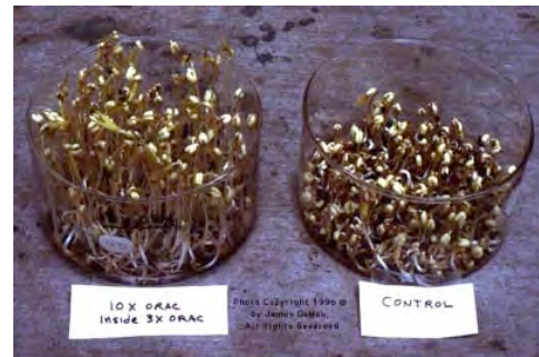
Orgone-Charged Mung Beans (left) versus Control Group (right)