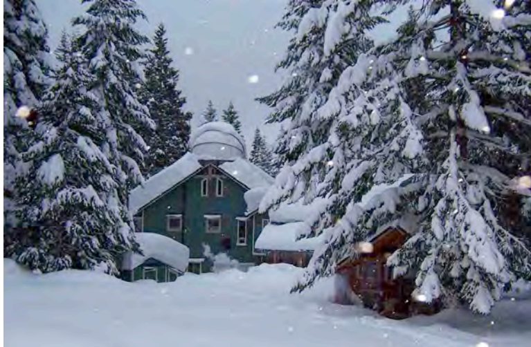
Intense Wintertime Scene (2008) at the Orgone Biophysical Research Lab (OBRL)