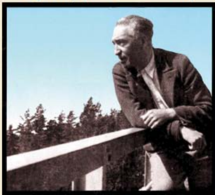
Wilhelm Reich in Norway, 1939

Research Report and Journal of the Orgone Biophysical Research Laboratory